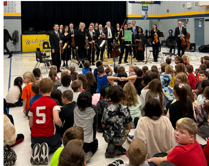
Students at Gore Hill Public School experience the WSO.