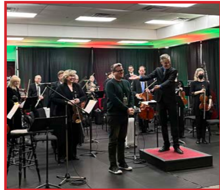
The WSO launches its holiday CD, " Christmas, eh? " at the WFCU Centre.