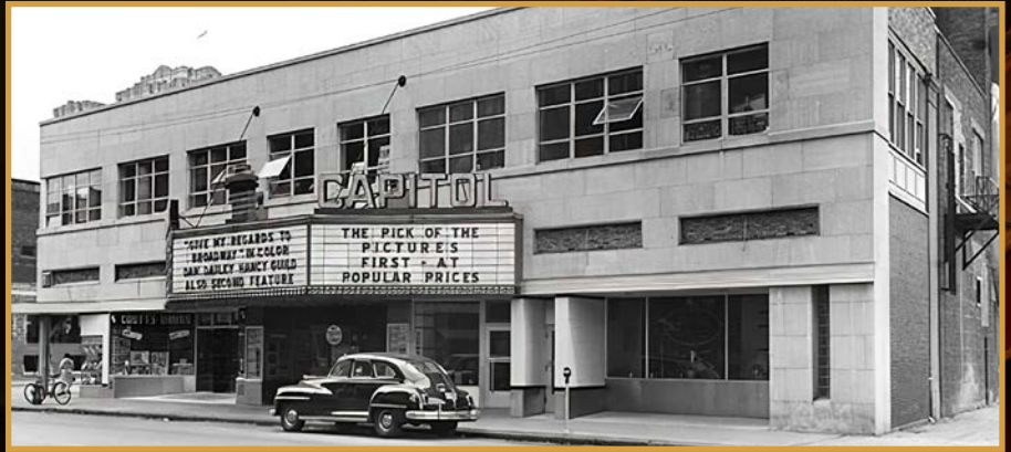
The Capitol Theatre, 1948.

Built in 1920, the Capitol Theatre celebrated its 100th Year Anniversary on February, 18th, 2023.