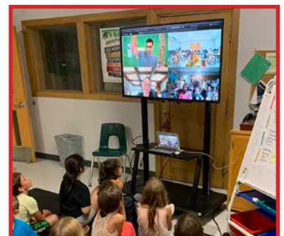
Students participate in the WSO's Digital Education Concert Series. This series is available year round and includes free activity worksheets for teachers.