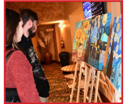
Patrons view art at the WSO's interactive presentation "Vincent Van Gogh: from Darkness to Light", a partnership with Art Windsor Essex.