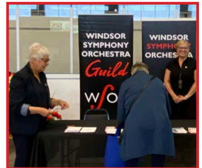
The WSO sets up at Amherstburg's Active & Aging Well Expo, providing information on concerts, Capitol Theatre events, and free activities.